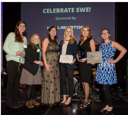
Accepting the Awards at Nationals

In October, twelve members attended the SWE national conference in Philadelphia, PA. Joining brilliant women and men from a variety of industries. Attendees expanded their horizons through participating in workshops, networking, and going to a large career fair. Several members received job and internship offers while at the conference! Women gained inspirational leadership skills, learned of useful resources for our section, and developed as professionals.