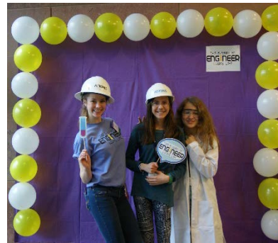
IAGE Volunteer with Participants

Not stopping with our collegiate audience, we were excited to share our passion for creativity through STEM with over 100 middle school girls and their families. Our first annual Introduce a Girl to Engineering Day (IAGE) happen on April 1. This event engaged budding minds through interactive projects, tours, and presentations. SWE partnered with 14 student organization to put on these activities. Imagination was encouraged as youth were exposed to the different disciplines