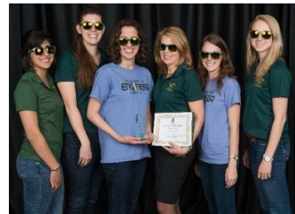
Accepting the CSU Student Leadership Awards