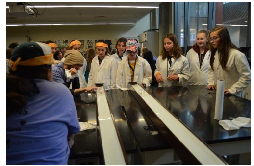
Hand-made Chem-E boat racing with current engineering students

Introduce a Girl to Engineering Day is an event hosted by the Society of Women Engineers Section at CSU. The day is full of hands-on engineering activities , with lunch and snacks provided. A parent education panel is also held to give more insight on how to encourage young women in STEM.