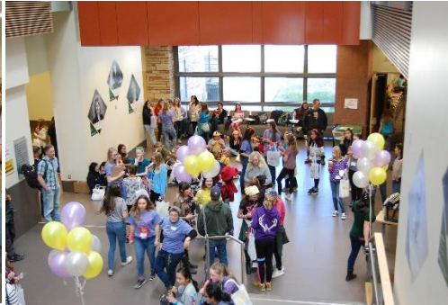
More than 120 middle schoolers and 100 volunteers present day of