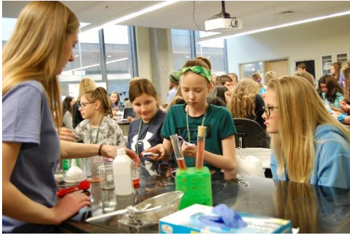
Strawberry DNA extraction activity in the CSU engineering laboratories

An opportunity for middle school girls to discover and learn about the different disciplines of engineering at Colorado State University . Meet current engineering students and learn how engineers positively impact the world!